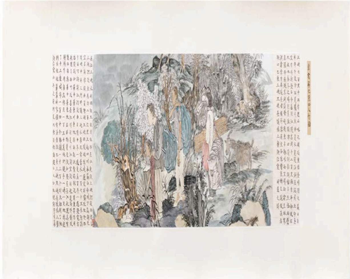
YunFei Ji, "Four People Leaving Badong" (2009), ink and watercolor on Xuan paper, mounted on silk, 22 1/8 x 66 1/4 in (56.2 x 168.3 cm), The Carolyn HsuBalcer and René Balcer Collection (image courtesy James Cohan Gallery, New York, © YunFei Ji 2016) (click to enlarge)

Ji was educated at the Central Academy of Fine Arts in the 1980s and recalled, in conversation with Hyperallergic, a particular program which brought students to the countryside to live with farmers. It was there that the artist learned to observe from everyday life and "create with, rather than imitate, nature." During this time, Ji had to "rediscover" ink painting , after the government had wiped the art form clean off the slate during the Great Leap Forward due to its roots in philosophies such as Confucianism, Buddhism, and Daoism. China today suffers from a different kind of amnesia: its attempt to "catch up with the West" has fueled government-led urbanization initiatives resulting in omnipresent pollution of the environment. To combat such destructive thinking, Ji says looking back on the country's cultural traditions — specifically the central tenet in Chinese philosophy of tian ren he yi , harmony and unity between humankind and nature — is imperative for survival.