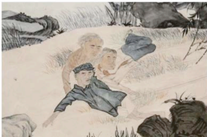
Yun-Fei Ji, "Part Secretary's Dream" (detail, 2015), ink and watercolor on Xuan paper, 15 ¼ x 41 1/8 in (click to enlarge)