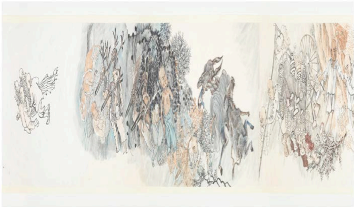
Yun-Fei Ji, "The Move of the Village Wen" (end detail, 2012), ink and mineral pigments on Xuan paper mounted on silk, 13 3/8 x 48 1/8 in (34 x 122.2 cm) (courtesy the artist and James Cohan, New York, ©Yun-Fei Ji) (click to enlarge)

Despite a meditative presentation, the content of Ji's paintings is heavy. To many a Western eye at first glance, Ji's elaborate worlds float in the formal traditions of Chinese ink painting. Yet upon closer inspection, one observes an amalgam of cultural signifiers from contemporary life that are anything but idyllic. The artist gathered source imagery for his lengthiest work, the 61-foot scroll "The Village and its Ghosts," during his time in Hurricane Katrina–devastated New Orleans, which Ji relates to China's Three Gorges Dam construction in terms of government failure: the building of the Zhaitang, Wu, and Xiling sites resulted in the demolition of entire villages and the displacement of one and a half million people. Whether Ji is referencing the Lower Ninth Ward, Badong village, or Columbus Park in Manhattan's Chinatown, globalization, corruption, and ecological alteration encroach on his scenery. Amid the lush landscapes, one finds delimbed villagers, paramilitary officers, party secretaries, strangled animals, and partially skeletal creatures. Though the imagery is fantastical and often grotesque, it is informed by the artist's real life encounters.