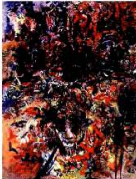
Martin Luther King's Garden, 1968, oil on canvas, 51 1/2 by 41 1/2 inches.

The Alexander Gray exhibition gathered five recent memorial paintings, all 48 inches square, their mosaiclike compositions derived from the grids, spirals and perforated edges of e-stamps. 4 This use of a readymade compositional device dates back to the 1990s, when Whitten sought to derive his compositions rather than invent them. Some paintings were organized according to the forms of individual kernels of popcorn, random arrangements of buttons or fragmentary shapes from maps. The mosaic memorials include the colorful E-Stamp IV (Five Spirals: For Al Loving) , 2007, along with the darkly somber E-Stamp II (The Black Butterfly: For Bobby Short) , 2007. In each case, Whitten has chosen a palette and design that best conjures up for him some sense of the achievements, ideas or spirit of the person memorialized. Communicating these subjective and hermetic specifics is not part of his intention. As has