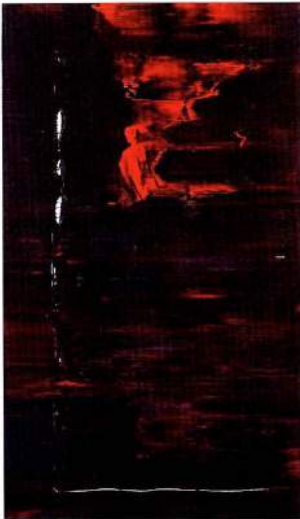
Chinese Sincerity, 1975, acrylic on canvas, 67½ by 49 inches.

Truitt, whose work occupied the gap between Greenberg's process-oriented formalism and Minimalism's reductive industrial aesthetic. What these approaches to painting (and art making in general) shared was a sense of material literalism derived from Abstract Expressionism. In Whitten's case, the transition from figurative expressionism in the '60s to abstraction in the '70s reflects an internalization of these debates as well as his own highly personal, nonpartisan determination to use aspects of differing perspectives to continue to give expression to his feelings.