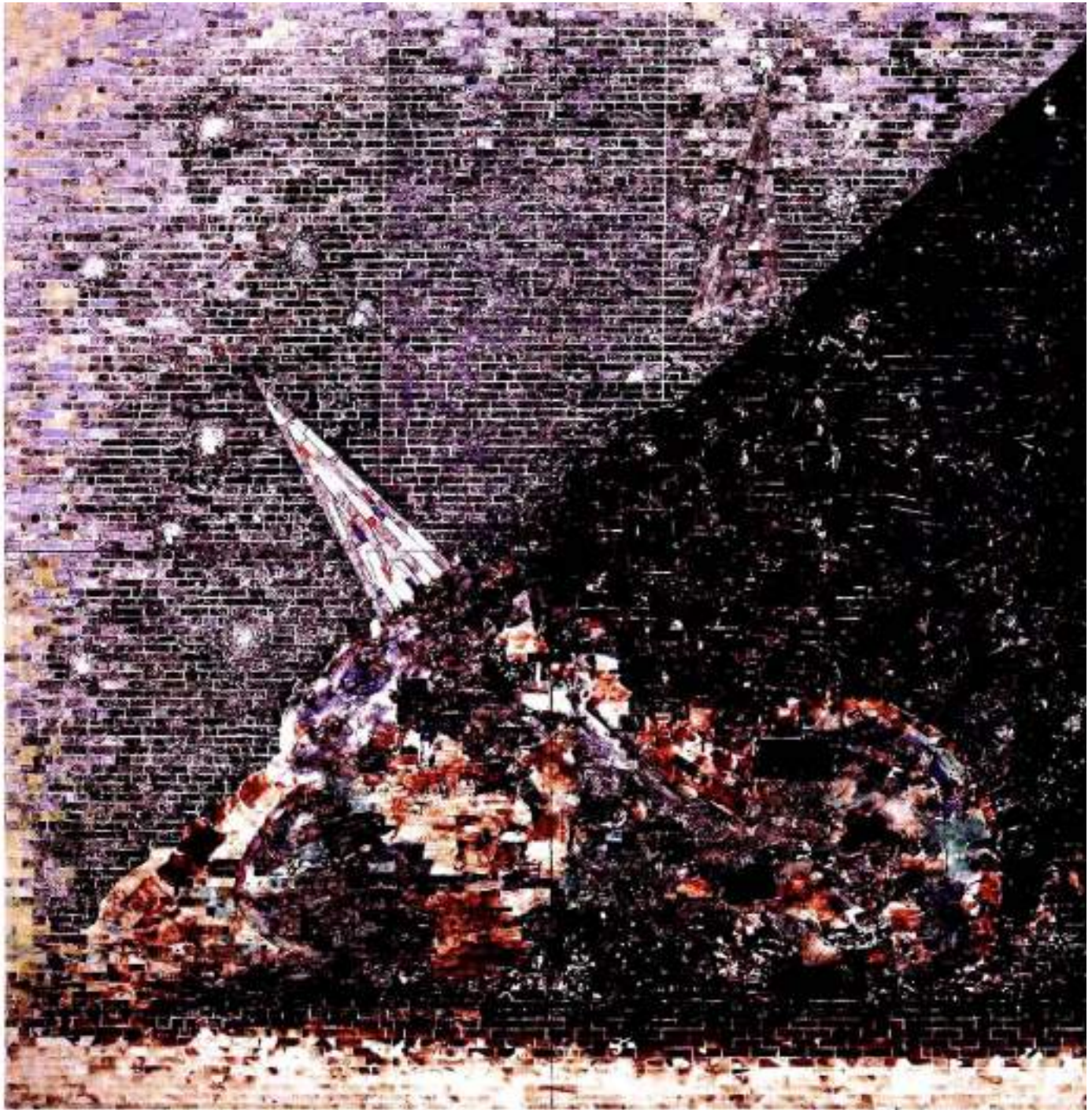
9.11.01, 2006, mixed mediums on canvas, 120 by 240 inches.

1959, inspired by Martin Luther King, Jr., Whitten participated in a major civil rights campaign, which first forced the university to close down and then expanded into a protest march through Baton Rouge to the State Capitol Building. The anger, hatred and violence that met this march so horrified Whitten that he realized he could no longer live in the South. In 1960 he left for New York to further his studies at Cooper Union, where he received his BFA in 1964.