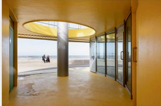
Project Compagnie O architects + John Körmeling.

The circular plan, with a diameter of 17m, is designed like the mechanism of a clock. It is defined by four distinct zones with different functions, interconnected with public passages and intermediate spaces.