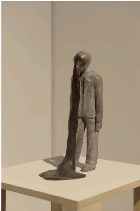
Grace Schwindt, Tears , 2019, bronze, Courtesy: the artist and CCA Glasgow

Main image: Grace Schwindt, Five Surfaces All White, 2019, film still. Courtesy: the artist and CCA Glasgow